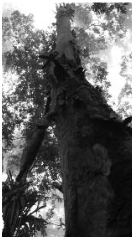
Upwards view of the trunk of an Oreomunnea mexicana tree with epiphytes, mosses and lichens in a cloud forest stand in central Veracruz.

The cloud forests of Mexico are immensely valuable for the ecosystem goods and services that they provide. The forests are exceptionally rich in botanical diversity with over 2,800 plant species recorded within them. The diversity of tree species, approximately 25% of the total botanical diversity, defines the forest structure and contributes to the ecological function and resilience of the forests. The trees also provide a wide range of products valued by local people. Unfortunately the cloud forests of Mexico, as elsewhere in the world, are under severe threat. The component trees are also threatened with extinction to a varying degree. This report presents a review of the conservation status of the Mexican cloud forest trees, undertaken by Mexican experts in partnership with FFI and the IUCN/SSC Global Tree Specialist Group. It is the result of a remarkable collaborative process over four years bringing together botanists and ecologists who care about the future of the forests and trees of Mexico.