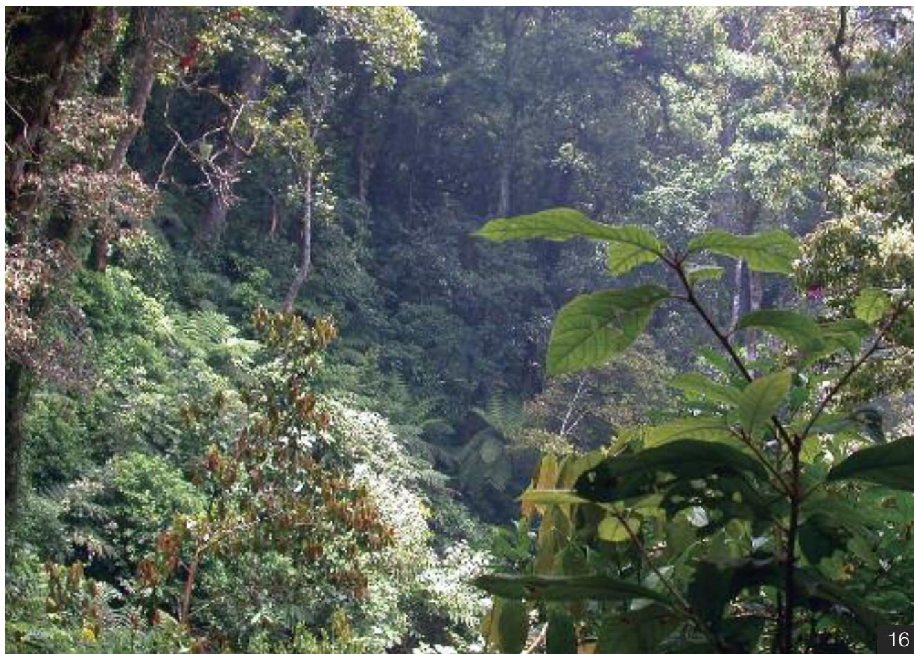
16. A steep slope of cloud forest in Bachajón, Chiapas, southern Mexico.